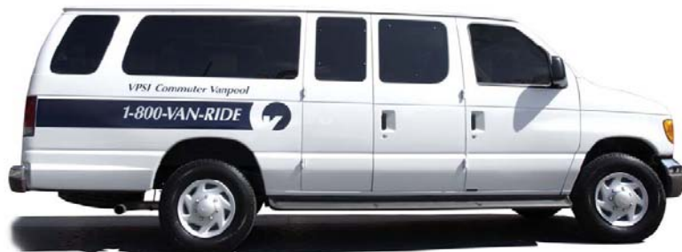
MY09 15-Passenger Split Bench