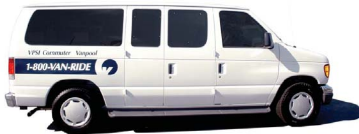
MY09 9-Passenger Luxury